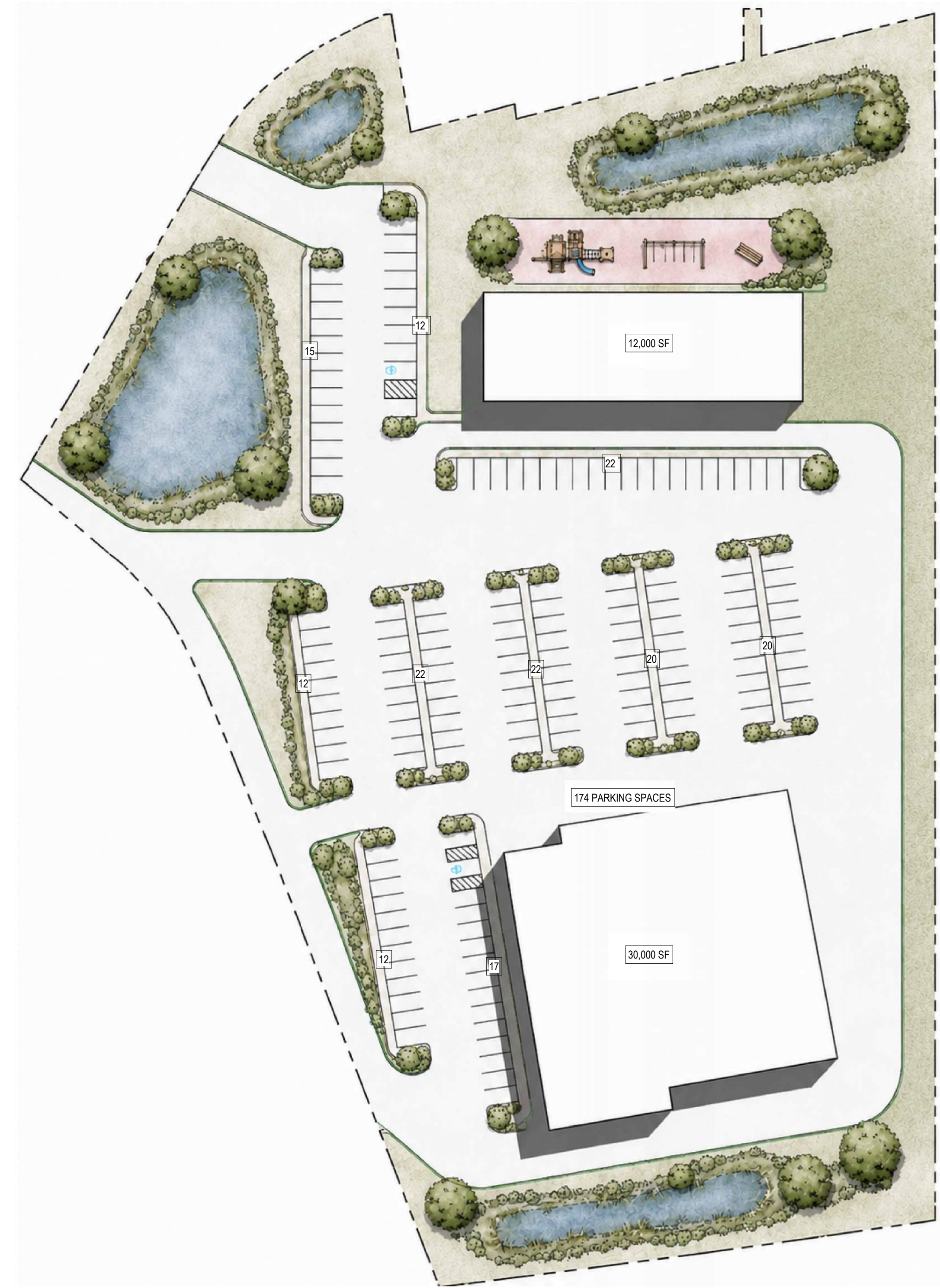
3 SITE PLAN OPTION 2 SCALE: 1" = 50'-0"