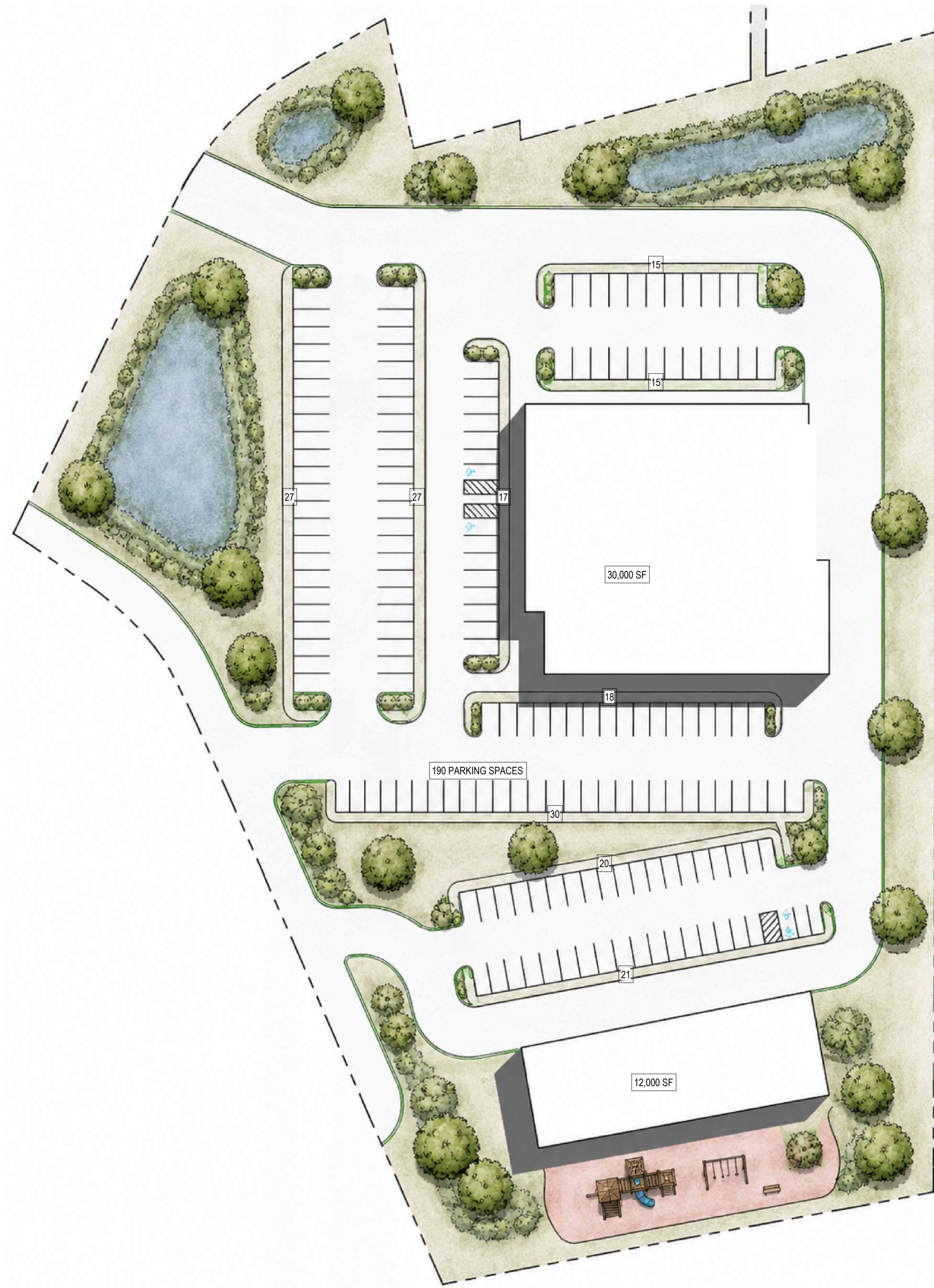
2 SITE PLAN OPTION 1 SCALE: 1" = 50'-0"